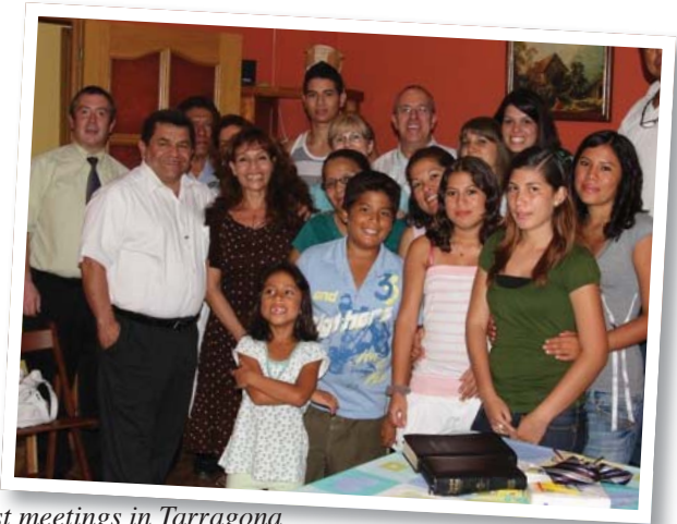
First meetings in Tarragona

Once more, thanks for your prayers and support. Our work in the States or in Spain would be impossible without your help. May the Lord bless you.